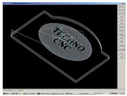
Toolpath/Part Preview Screen