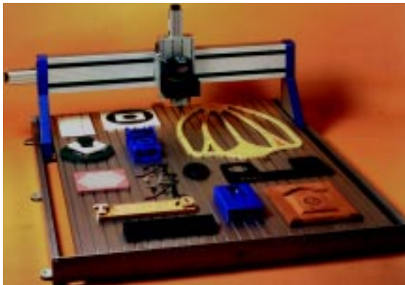
CNC Router System (Gantry table only)