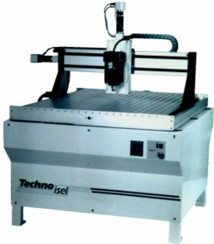
Turnkey CNC Router System (Machine stand included; optional spindle shown above)