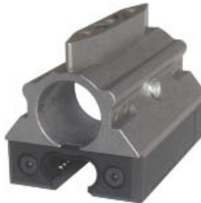
BEARING CARRIAGE 4: HL46D0M223007