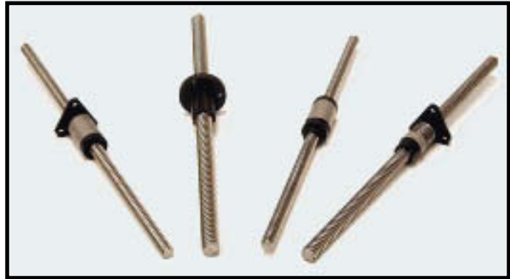
(Acme Nuts Purchased Separately)