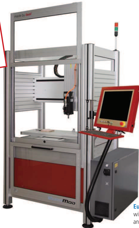
EuroMod MP 45 with control panel iOP-19-TFT and open sliding door