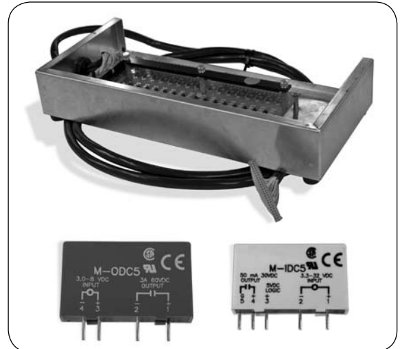
I/O Breakout Board (I/O modules sold separately)