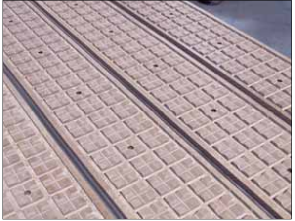
Grid pattern offers maximum flexibility and provides easy customization of table surface.

In comparison to the other vacuum systems, a 10HP regenerative blower is the lowest in cost, generally retailing for around $5,000. Regenerative vacuum blowers, consist of an electric motor coupled via belt or direct drive to the vacuum pump impeller. The motor rotates the impeller, drawing air in the inlet and discharging the air through the exhaust, creating vacuum. Because the inexact dimensional tolerances from the impeller to the housing, air is allowed to escape, resulting in lower vacuum pressure. This is known as slippage. Regenerative vacuum blowers typically generate low vacuum pressure, but generate greater volume of air as described in the earlier example of 11"Hg at 105 scfm. The noise consideration is a very real concern for these products. A regenerative vacuum blower runs in a decibel range of 85 to 95. This type of vacuum is ideal for holding less dense materials such as foam and other porous materials. The required maintenance is minimal with regenerative blowers, usually limited to replacing air filters.