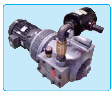
Rotary Vane Vacuum Pump

due to the release of this pressure. Typical decibel ranges for a $8,500 10 HP unit run from 95 to 100. Positive displacement rotary blowers should be enclosed providing some sound protection. A max vacuum of 15"Hg @ 250 scfm makes these units ideal for wood.